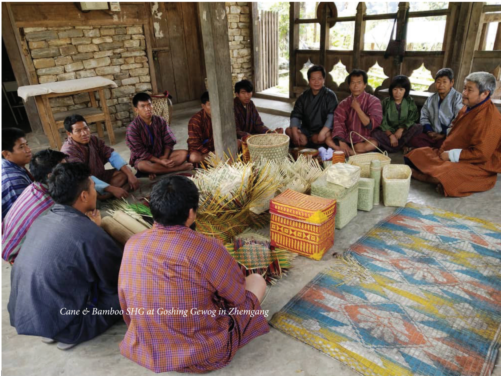
Cane & Bamboo SHG at Goshing Gewog in Zhemgang

Supported by the SAARC Development Fund, the project “Promoting Integrated Bamboo Based Enterprise Development among SAARC Countries” is currently being implemented in Gongdue, Silambi and Saling in Monggar and in Ngangla, Goshing and Bjoka in Zhemgang. The project aims to create sustainable high value economic opportunities that will directly improve the quality of life for farmers, artisans, micro & small enterprises, designers, traders and exporters. Research and Development of bamboo and its composites as engineering materials for various end-use applications is the second objective of the project. Creation of Community Facility Centres (CFCs) at both the Dzongkhags will provide the opportunity for development of bamboo based enterprises and will provide technical backstopping and facilitation as needed. In 2018, the achievements of the project are: