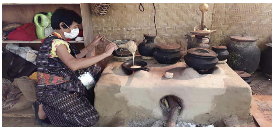
Making Buckwheat Pancake during the Bhutan Week

The Folk Heritage Museum participated in the "Bhutan Week" held in Delhi, India from 23rd to 30th September 2018, to showcase the country's tradition and cultural practices to mark the 50th anniversary of the establishment of formal diplomatic relations between Bhutan and India. As part of the celebrations, the Folk Heritage Museum demonstrated the Bhutanese way of life through food preparation, presentation of national attires and traditional handicrafts.