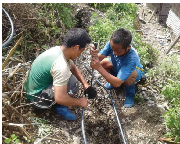
Fixing Water Pipeline at Samtse