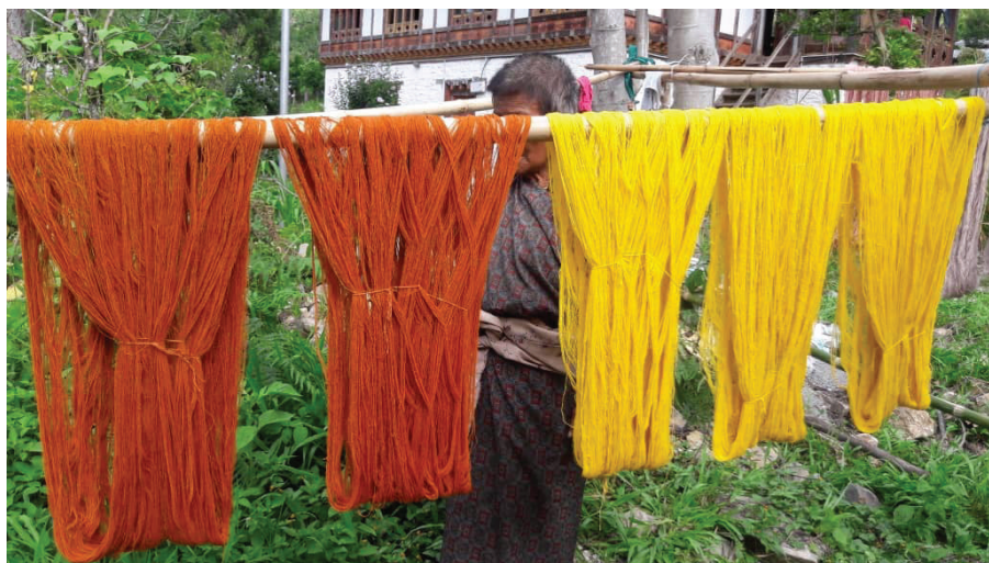
Natural Dyed Yarns at Pema Gatshel