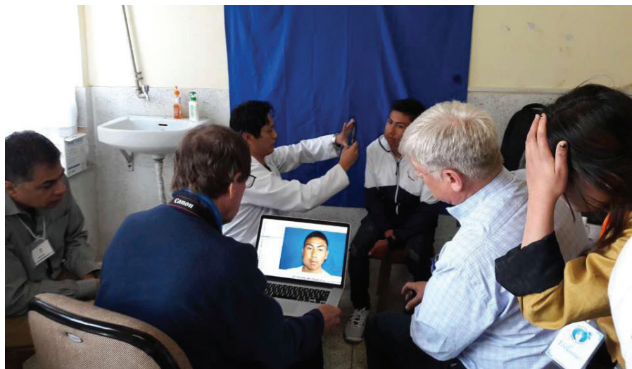
Surgicorps Team Screening Patients

The 12 th and the final restorative surgical camp with the Surgicorps International, USA and the Ministry of Health was conducted from 5 th to 14 th of May 2018 at the Paro District Hospital. 101 patients from all 20 Dzongkhags were screened, out of which 59 patients underwent surgery. The medical team focused on correction of cleft lip & palates, hand & ear deformities, burns, scars, bear mauls and fistula. A total of 215 senior citizens received the steroid knee injection to relieve arthritic pains.