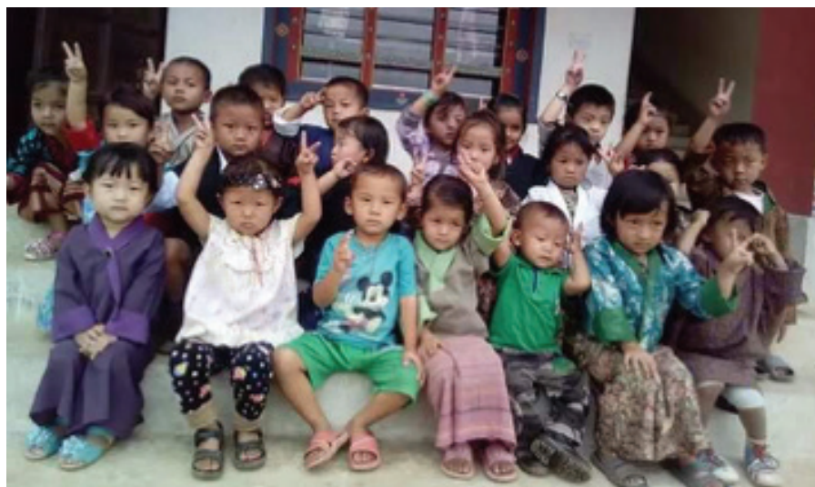
Tshendagang ECCD Centre in Dagana

Although all these ECCD centres have been handed over to the local government, Tarayana still engages with the facilitators and parents as these are in our communities and Tarayana is still informally responsible for quality assurance of the centres.