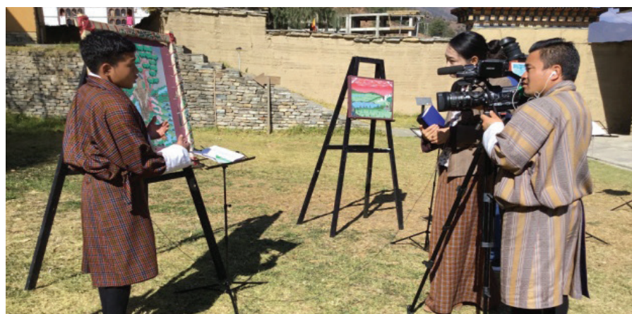
Media Interviewing One of the Artists