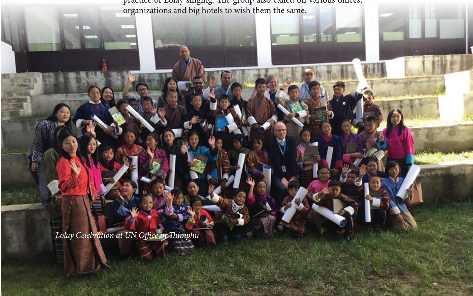
Lolay Celebration at UN Office in Thimphu

On 2 nd January 2018, a group of students selected from different schools in Thimphu called on their Majesties The King, The Gyaltsuen and His Royal Highness The Gyalsey at the Royal Lingkana Palace to wish the royal family good health, peace and happiness through practice of Lolay singing. The group also called on various offices, organizations and big hotels to wish them the same.