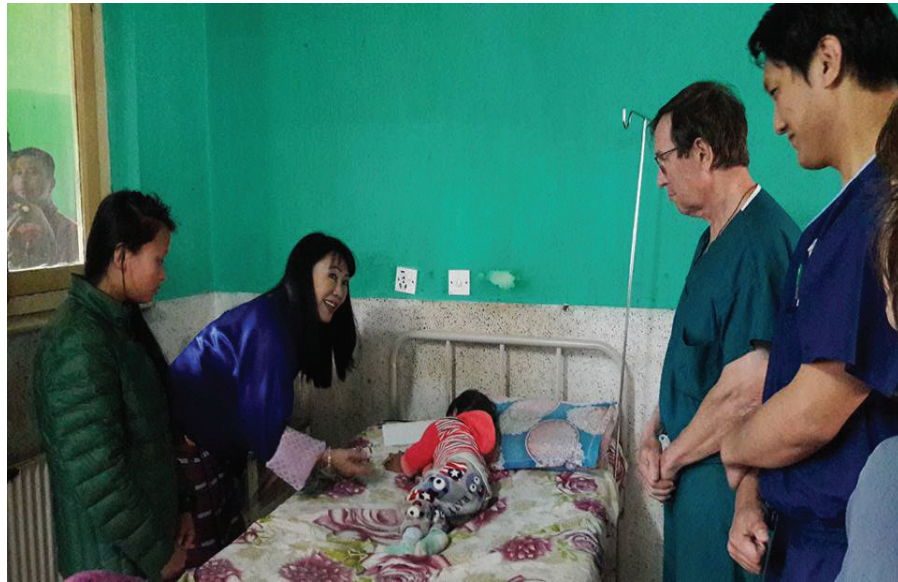
Her Majesty's visit during the 12th Surgical Camp, Paro District Hospital