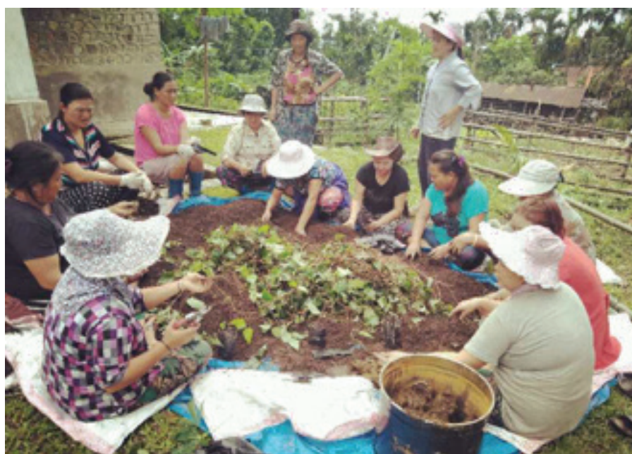
Betel Leaf Plantation in Edi Community

More than 200 Self Help Groups (SHGs) have been formed so far, with 3000+ members engaged in income generating activities such as cane, bamboo & nettle weaving, wood crafts, food processing, vegetable production, different cash crops, bee keeping, dairy farming, soap, candle & traditional paper making, sheep wool weaving and traditional pottery. The SHGs are formed to encourage team work and cohesiveness among the community members for common income generation. It is also for collective marketing and bargaining power of produce and products.