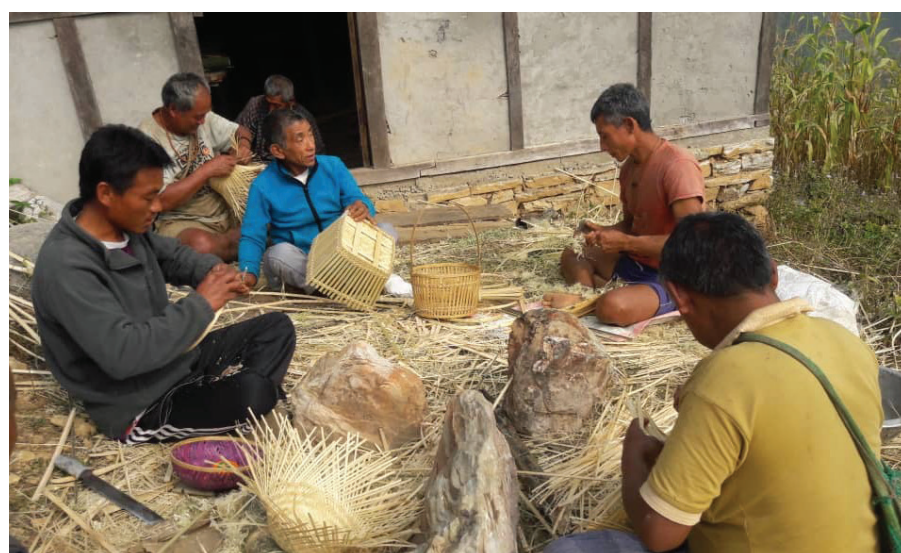
Cane & Bamboo Weaving at Chhimoong, Pema Gatshel