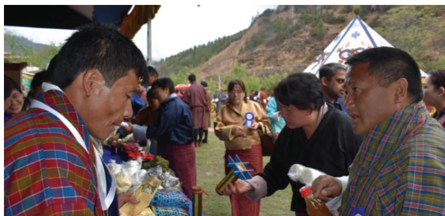
15th Tarayana Annual Fair