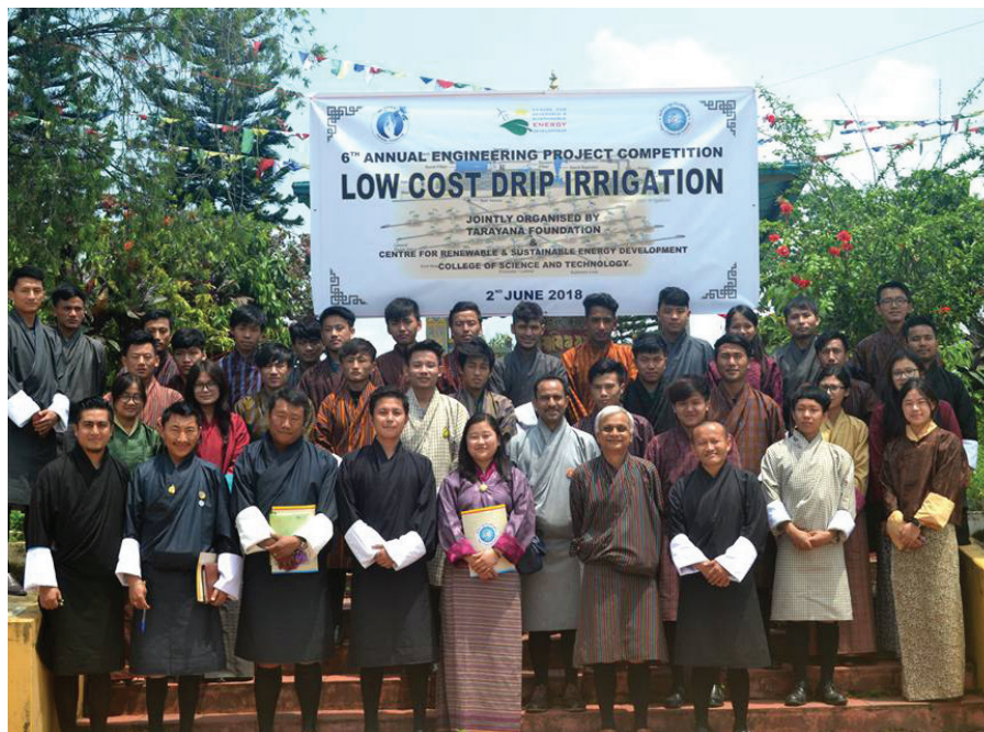
Tarayana team with CST Faculty and Student Participants

The annual green technology challenge was initiated in 2013 with the objective of contributing towards the national goal of remaining carbon neutral as well as giving platform to showcase innovation and creativity of the students.