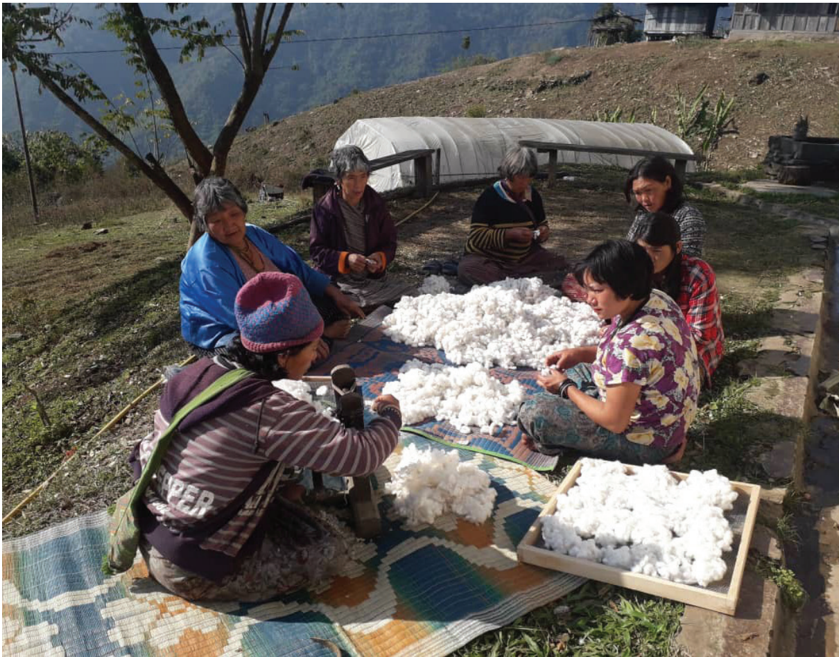
Cotton Harvest at Bangyul in Pema Gatshel