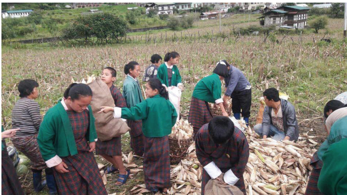
Club members of Jigme Sherubling Central School in Trashigang helping community members of Dawzor Village in Harvesting Maize