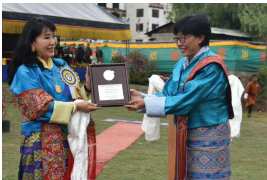
Secretary General of the Foundation was felicitated by Her Majesty for her dedicated 15 Years of Service from the Heart

The Annual Fair is one of the major platforms for the community members to market their products, meet potential clients and receive feedbacks on improving quality of their products.