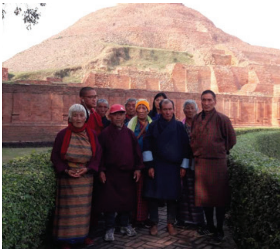
Pilgrims at Nalanda, India

The annual pilgrimage programme was initiated in 2008 to commemorate the Coronation of His Majesty The Druk Gyalpo Jigme Khesar Namgyel Wangchuck. Every year, a group of senior citizens from the rural communities are sent on pilgrimage. In 2018, eight elders from Lhuentse and Dagana Dzongkhags were able to visit the sacred sites of Bodhgaya, Nalanda and Varanasi among others. Tarayana Foundation is grateful to the donors for their continued support for this important rural senior citizen programme. To date, 92 senior citizens have undertaken the annual pilgrimage to Buddhist holy sites in India.