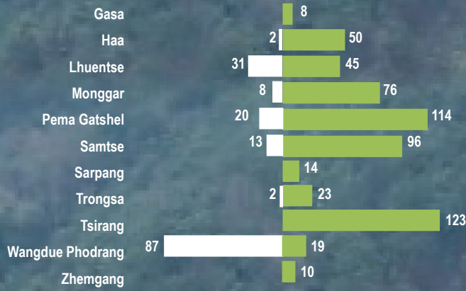
Fig 1 (a) Housing Improvement through REAP II :741