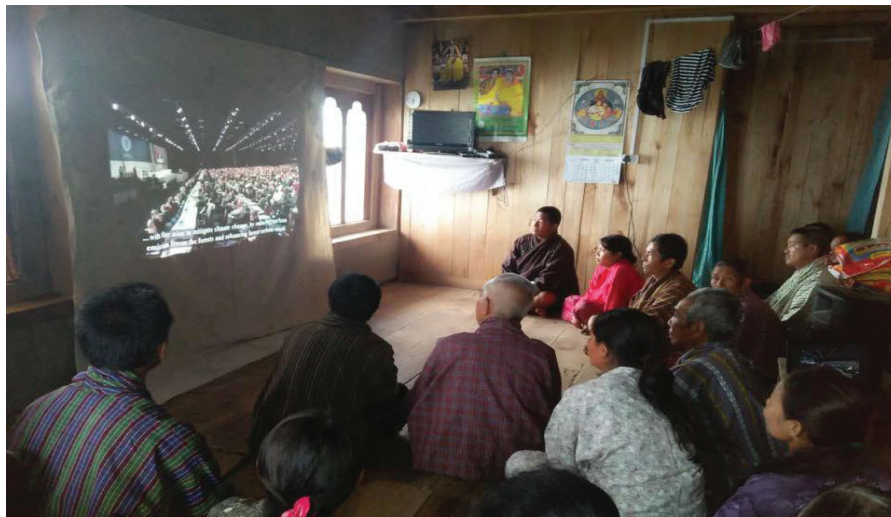
Watershed Awareness & Training at Haa

The project was funded by Forest Carbon Partnership Facility (FCPF) and executed through Tebtebba Foundation, an NGO based in Philippines. The Foundation organised awareness on REDD+, watershed management and trainings in Gakidling Gewog under Haa Dzongkhag, Chhimmoong Gewog in Pema Gatshel and Rookha Gewog in Wangdue Phodrang.