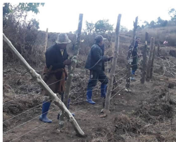
Electric Fencing at Lhuentse