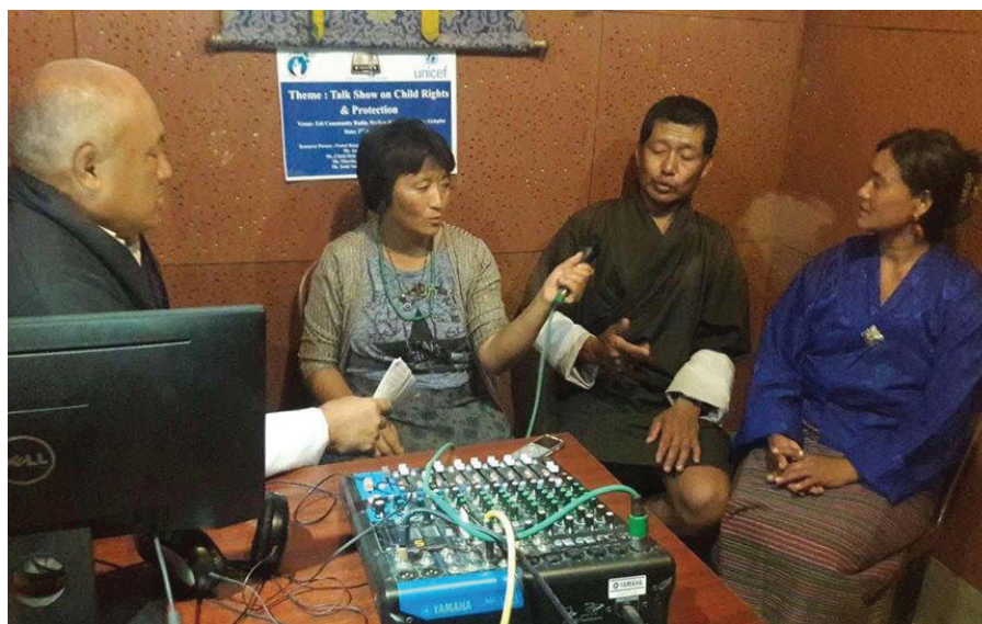
Panel Discussion on Child Rights and Protection at Edi Community Radio in Sarpang

With support from UNICEF, an awareness program on “Child Rights and Protection” was conducted at Dechen Pelri in Gelephu and Lotokuchu Jigme in Samtse in 2018. Domestic violence and gender equality were the topics covered besides child rights and protection.